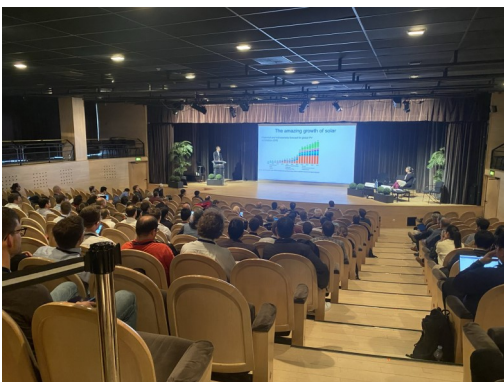
SiliconPV 2024, Châmbéry, France

Furthermore, the SiliconPV Conference maintains collaborative ties with nPV workshop , creating a consolidated platform for knowledge exchange. The nPV workshop provides a comprehensive overview of emerging trends, innovations and developments in n-type technology.