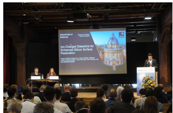
SiliconPV 2022, Konstanz, Germany